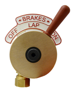
Brakes ON Position